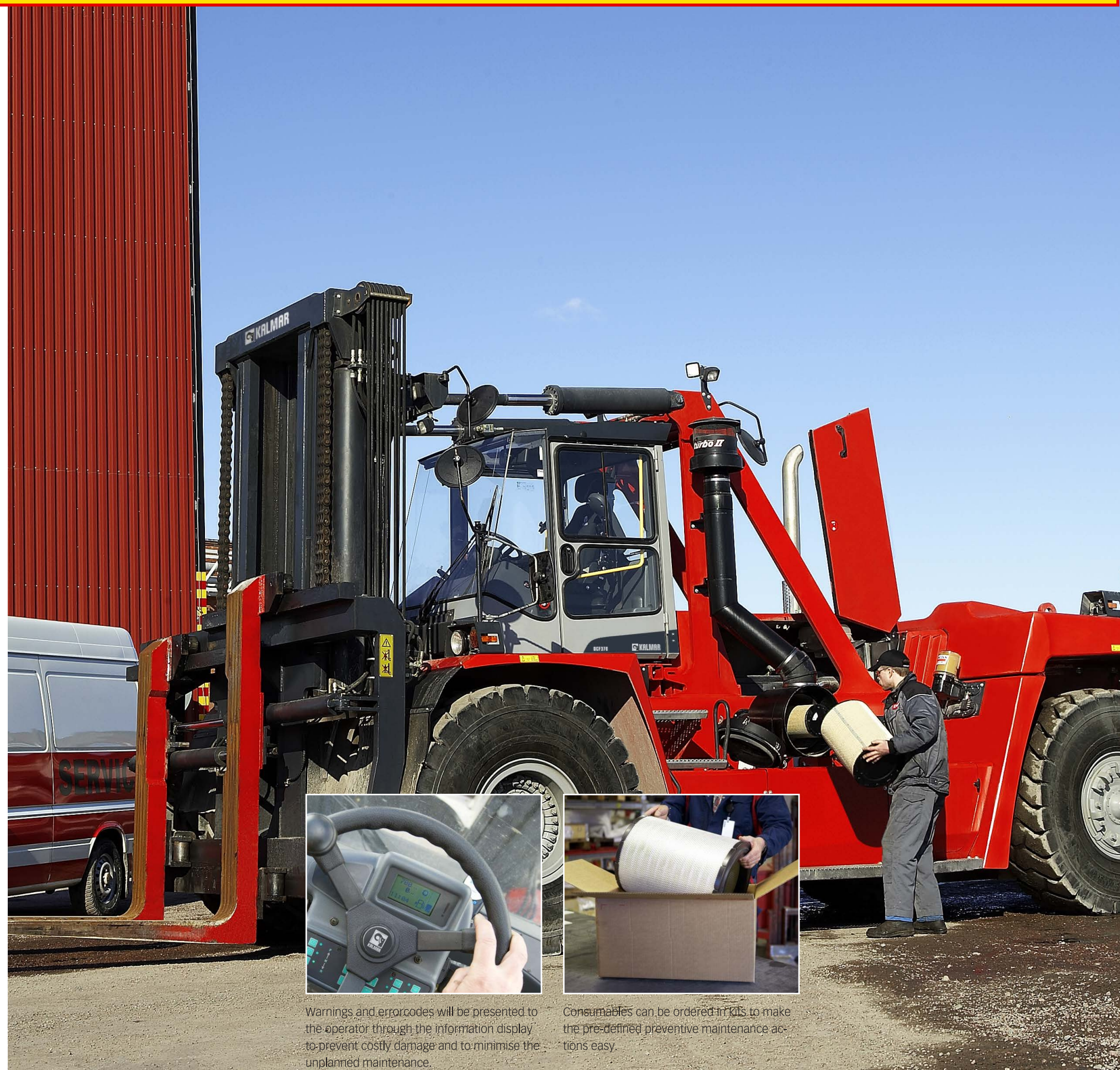
Warnings and errorcodes will be presented to the operator through the information display to prevent costly damage and to minimise the unplanned maintenance.